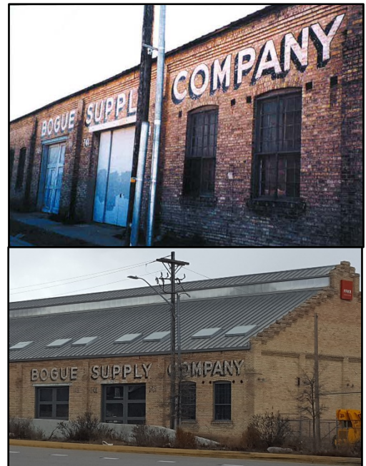
before (top) and after (bottom)

For a list of preservation contractors see Preservation Utah's Directory: * https://preservationutah.org/resources/tools-for-property-owners/ut-preservation-directory