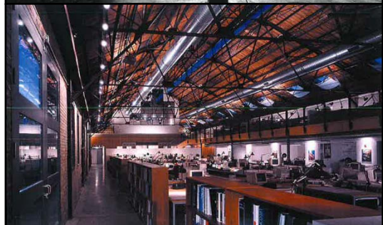
before (top) and after (bottom)