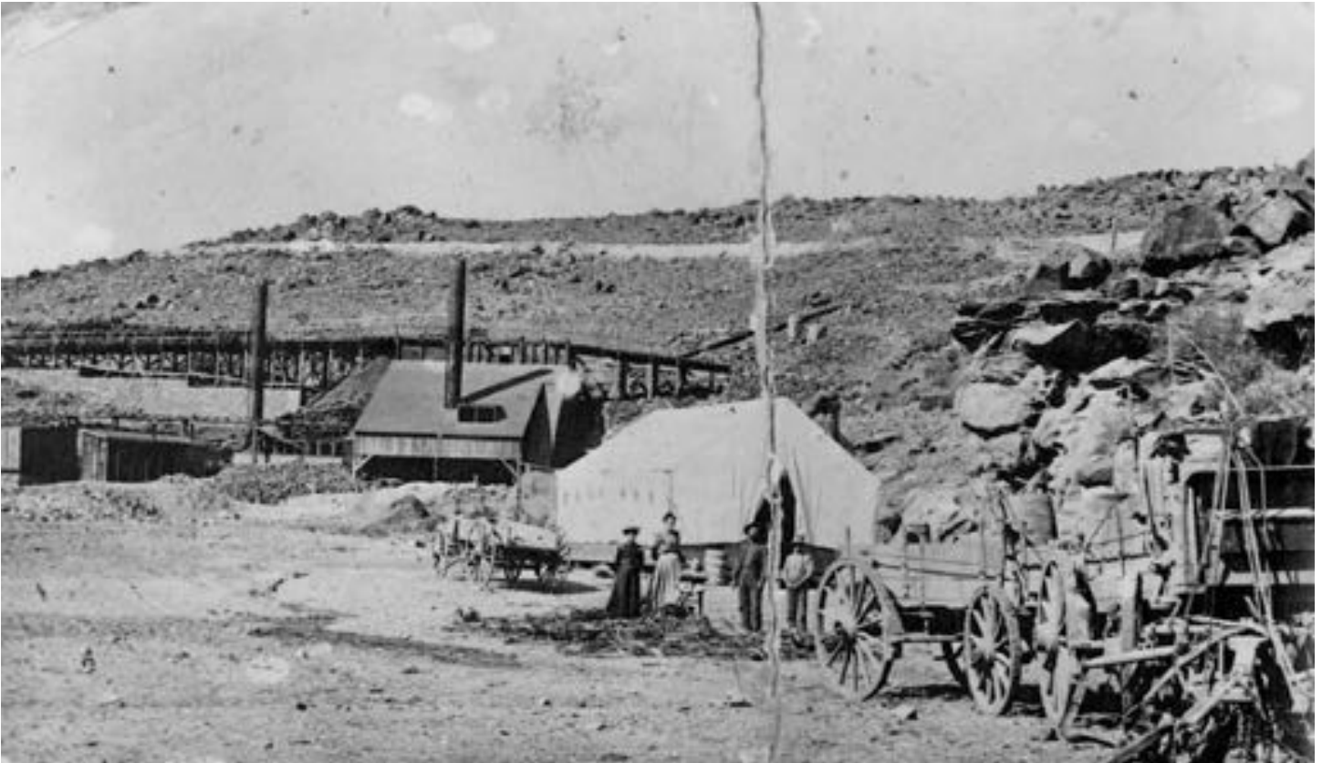
Shem Smelter, Utah and Eastern Copper Company 1902