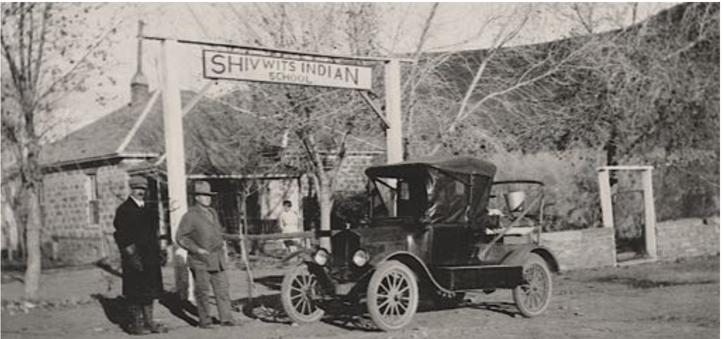
Shivwits Indian School, 1933

An Indian appropriation bill was passed by congress in late 1898, appropriating $25,000 for the purchase of land and the erection of buildings on Santa Clara creek. An additional $2,500 was set aside for the educational necessities of Shebits students.