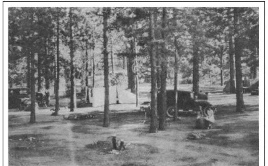
A Deteriorated Public Camp Unrestricted travel has destroyed all shrubbery and reproduction in the camping area.