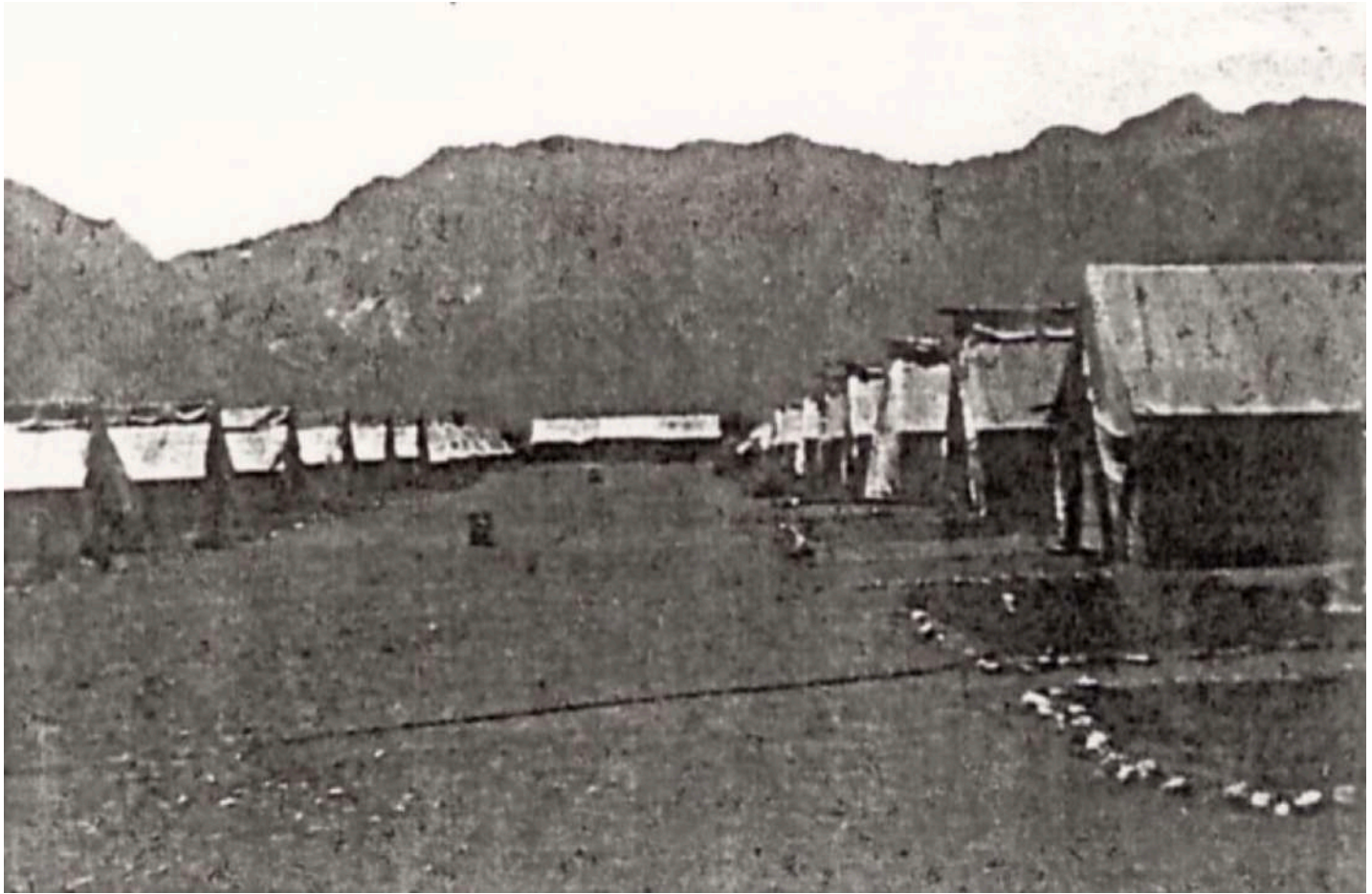
Pine Valley CCC Camp in 1933

Logging activities continued as applications for new sawmills were made and approved in the Dixie Forest Reserve until at least 1913. Fencing was erected by the Forest Service to protect the St. George city water supply from contamination by forest ranged cattle. Sheep were not allowed within the Forest Reserve. Improvements to roads and trails were made but within the limits of the manpower available.