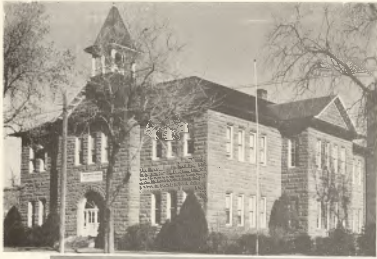
Woodward Administration Building