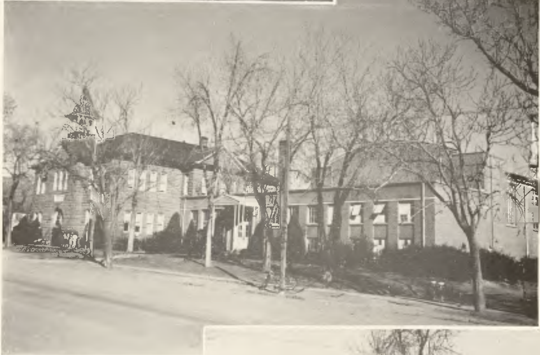
Athletic and Manual Arts Building