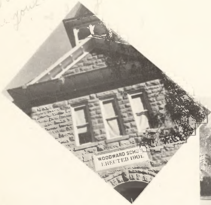
WOODWARD Administration Buildings