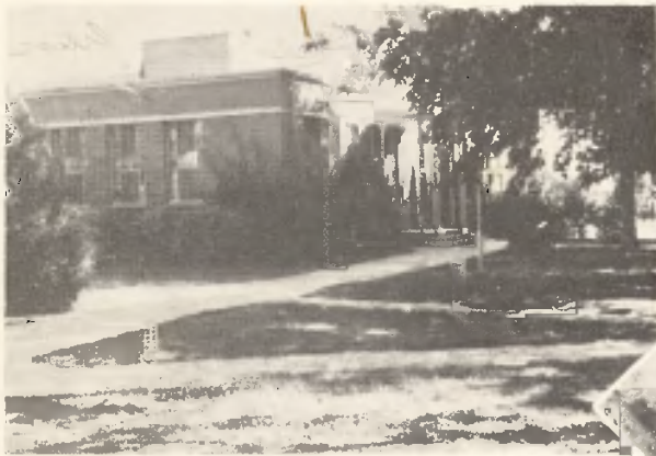
Athletic and Manual Arts Buildings