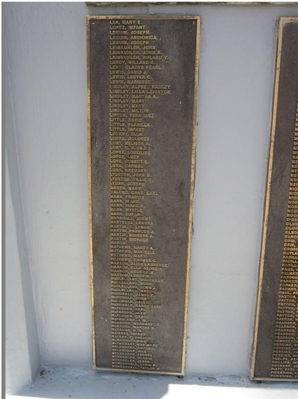
List of burials in Broadway Cemetery, later repurposed as a park (image from Findagrave.com )