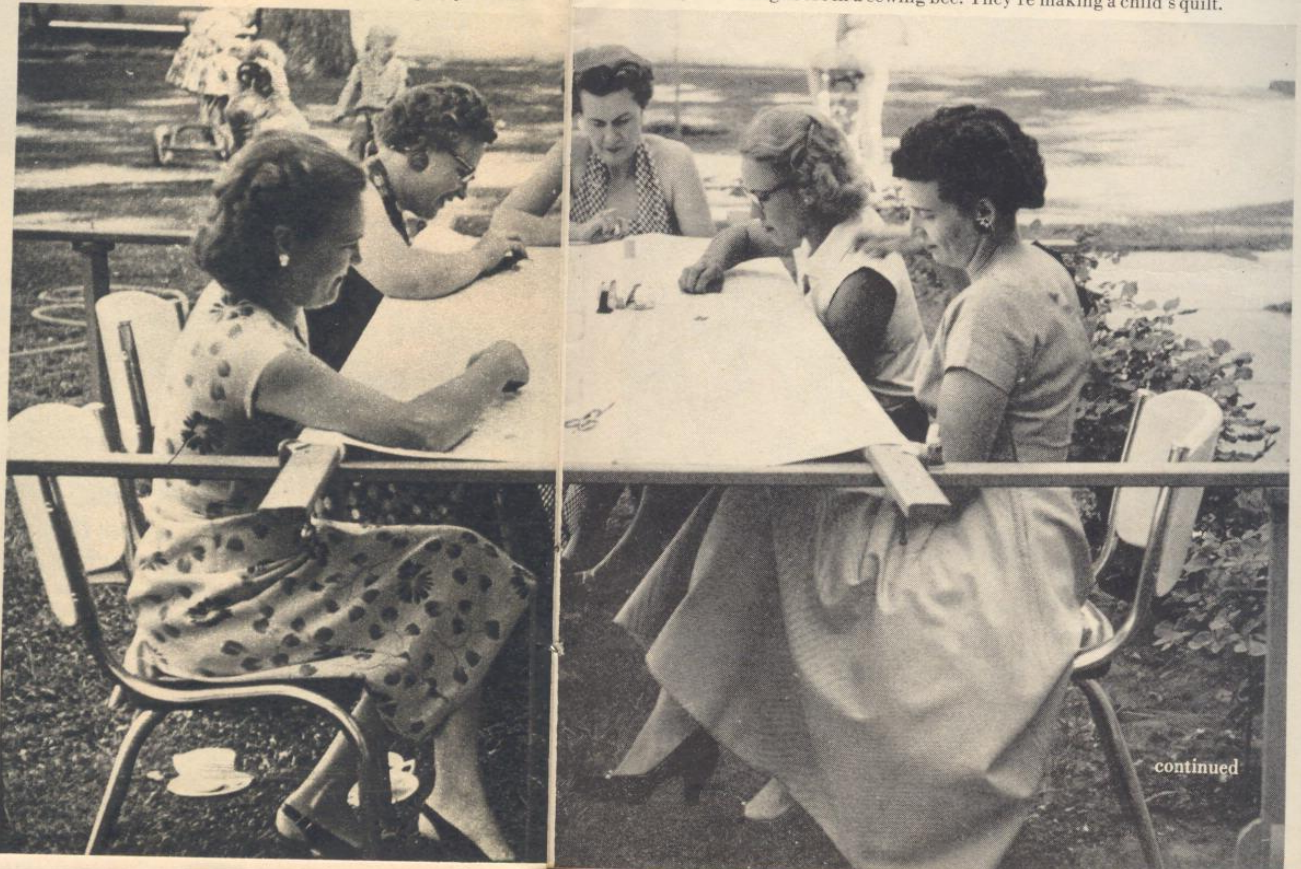
temporary Utah neighbors in a sewing bee. They're making a child's quilt.