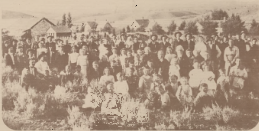
Photo taken at Old Terry Ranch in 1903