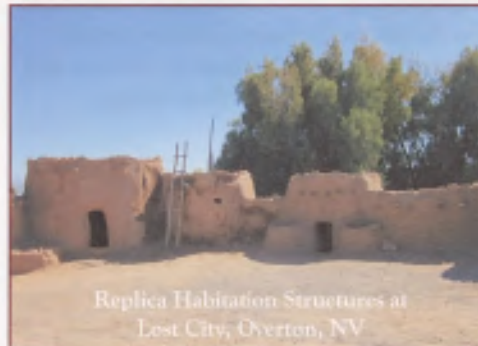
Replica Habitation Structures at Lost City, Overton, NV