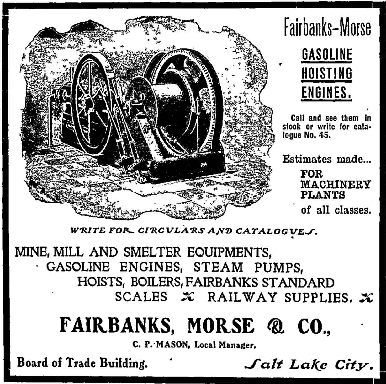
Fig. 2. Advertisement for Fairbanks, Morse & Co. showing a gasoline hoisting engine similar to the one the Grand Gulch Mining Co. purchased in 1901. From the Salt Lake Mining Review , September 30, 1901, p. 8.