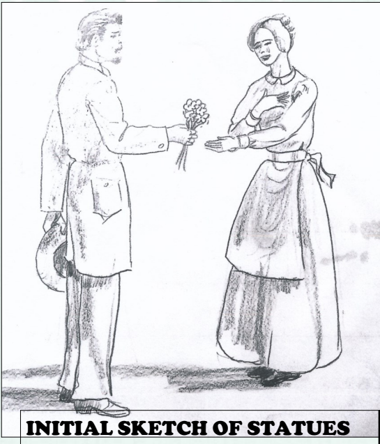
INITIAL SKETCH OF STATUES

The statue is to portray the wonderful 'Sego Lily Story' that has been told many times and is an example of the fortitude of our early Pioneer women.