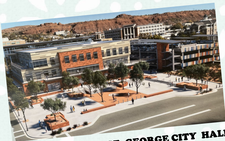
PROPOSED SITE—ST. GEORGE CITY HALL

Donating to the David & Wilhelmina Cannon Sego Lily Statue (wchsutah.org) or mail a check to WCHS (see address below)