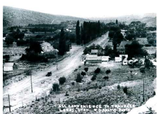
Leeds Main Street (1930s)