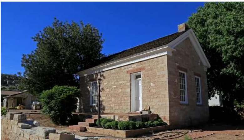
Leeds Tithing House (c. 1877)