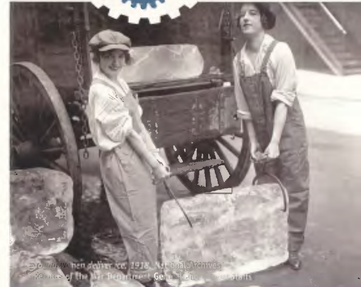
Two women in a factory, 1918.

The Way We Worked is a traveling exhibition created by the Smithsonian Institution and brought to you by Utah Humanities.