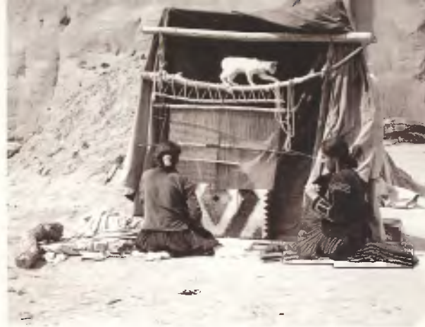
Navajo weavers, Monument Valley, 1941.

Join us to explore how work became such a central element in American culture by tracing the many changes that affected the workforce and work environments over the past 150 years!