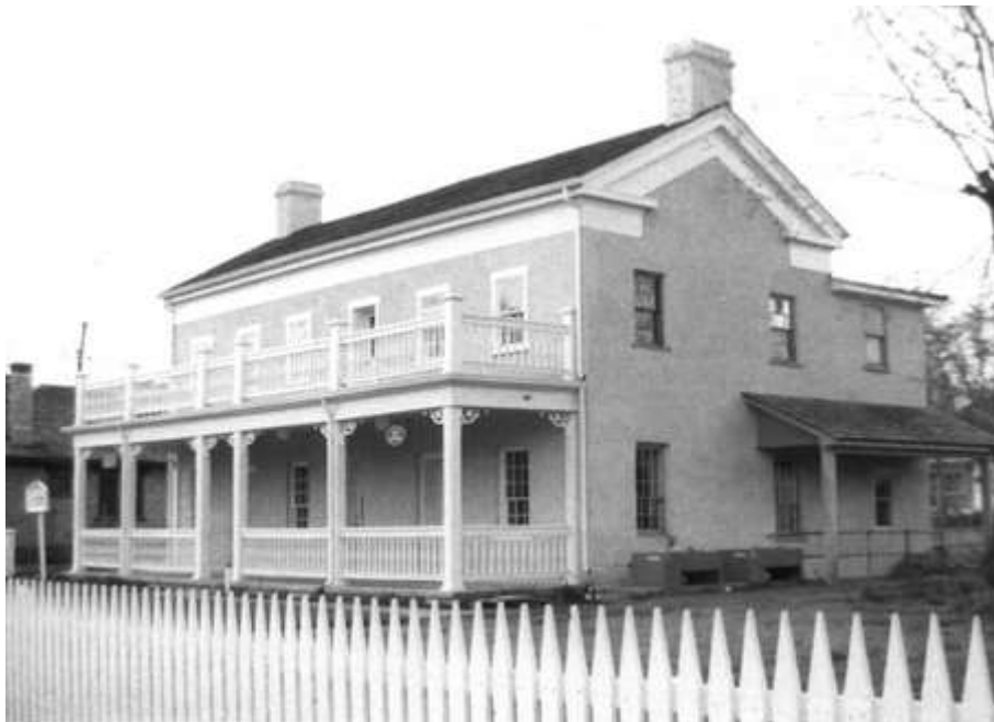
Orson Pratt Home in 1983