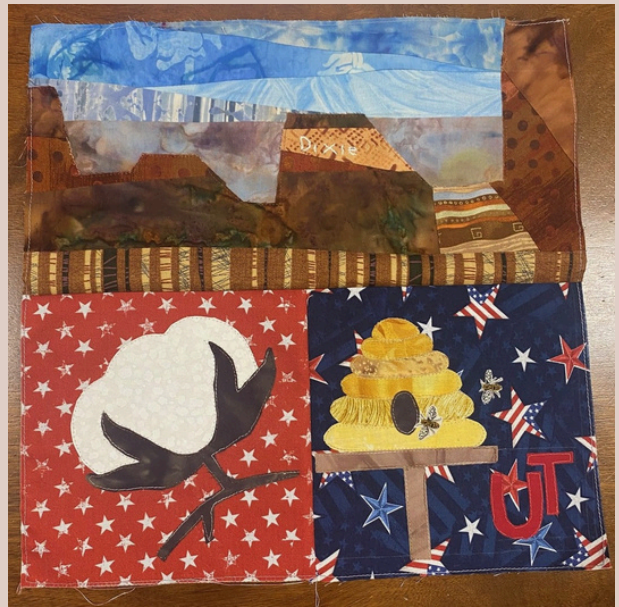
The winning quilt block showing off Washington County.