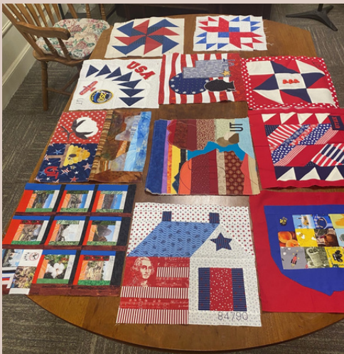
Eleven beautiful quilt blocks were submitted for the contest.