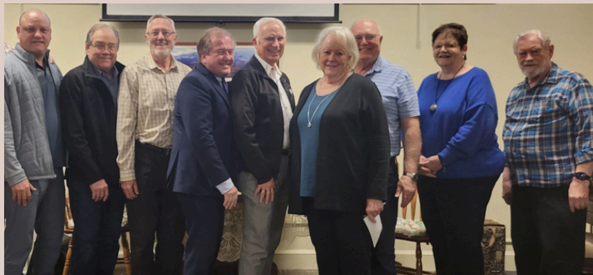
2026 WASHINGTON COUNTY HISTORICAL SOCIETY BOARD MEMBERS