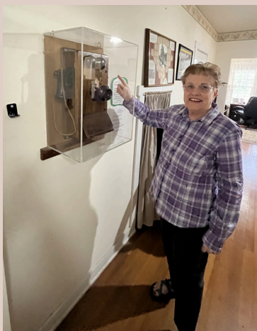
A docent shows a donated telephone.