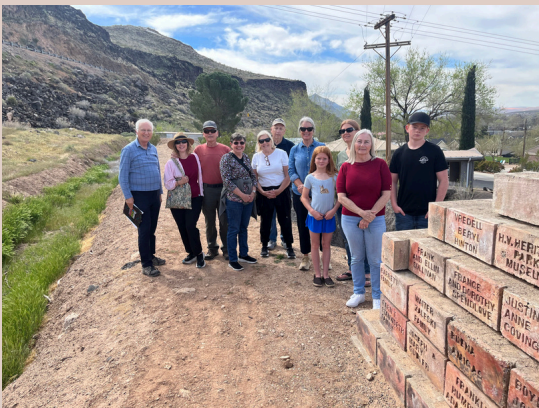
Participants on the field trip to Hurricane historic sites on March 14, 2026.

All photos by Loren Webb and Reuben Wadsworth.