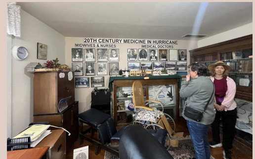
Participants view 20 th century posters of Hurricane, UT, doctors.