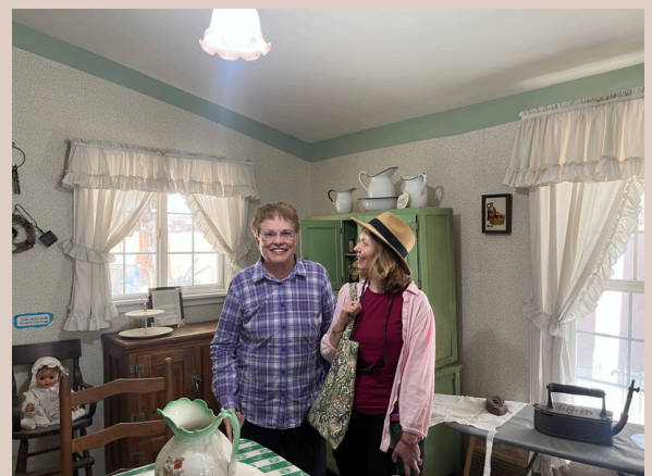
A docent and tour participant enjoy a moment in the kitchen.