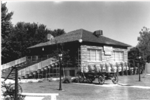
South and east side of the Hurricane Valley Heritage Museum Building (aka Hurricane Pioneer Museum)