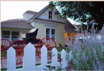
The Bradshaw House