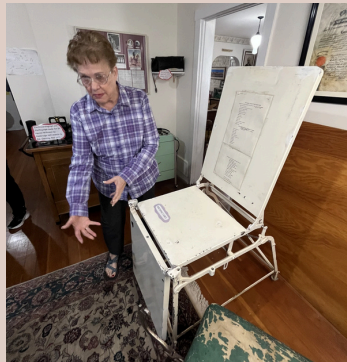
A docent demonstrates a woman's examining table.