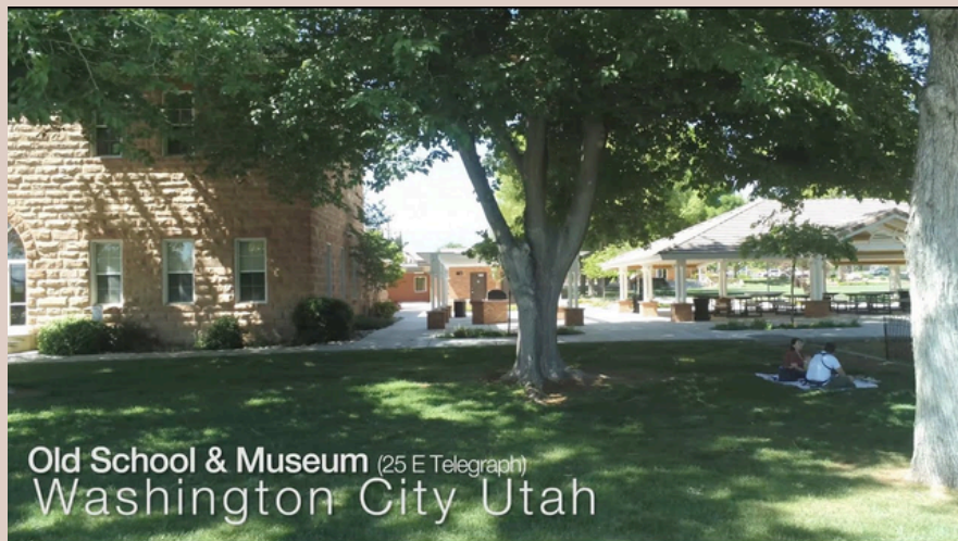
Old School & Museum (25 E Telegraph) Washington City Utah