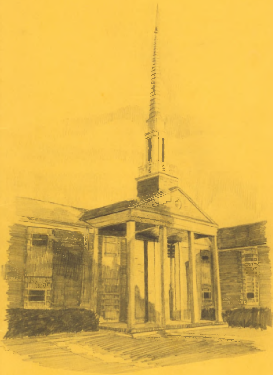
St. George 5th and 6th Wards Bishops Recognition Day October 29, 1978