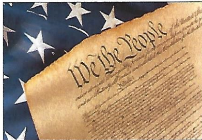
U.S. Constitution Week – September 17 th thru 23 rd

Let's Celebrate the FREEDOMS our Founding Fathers Fought For