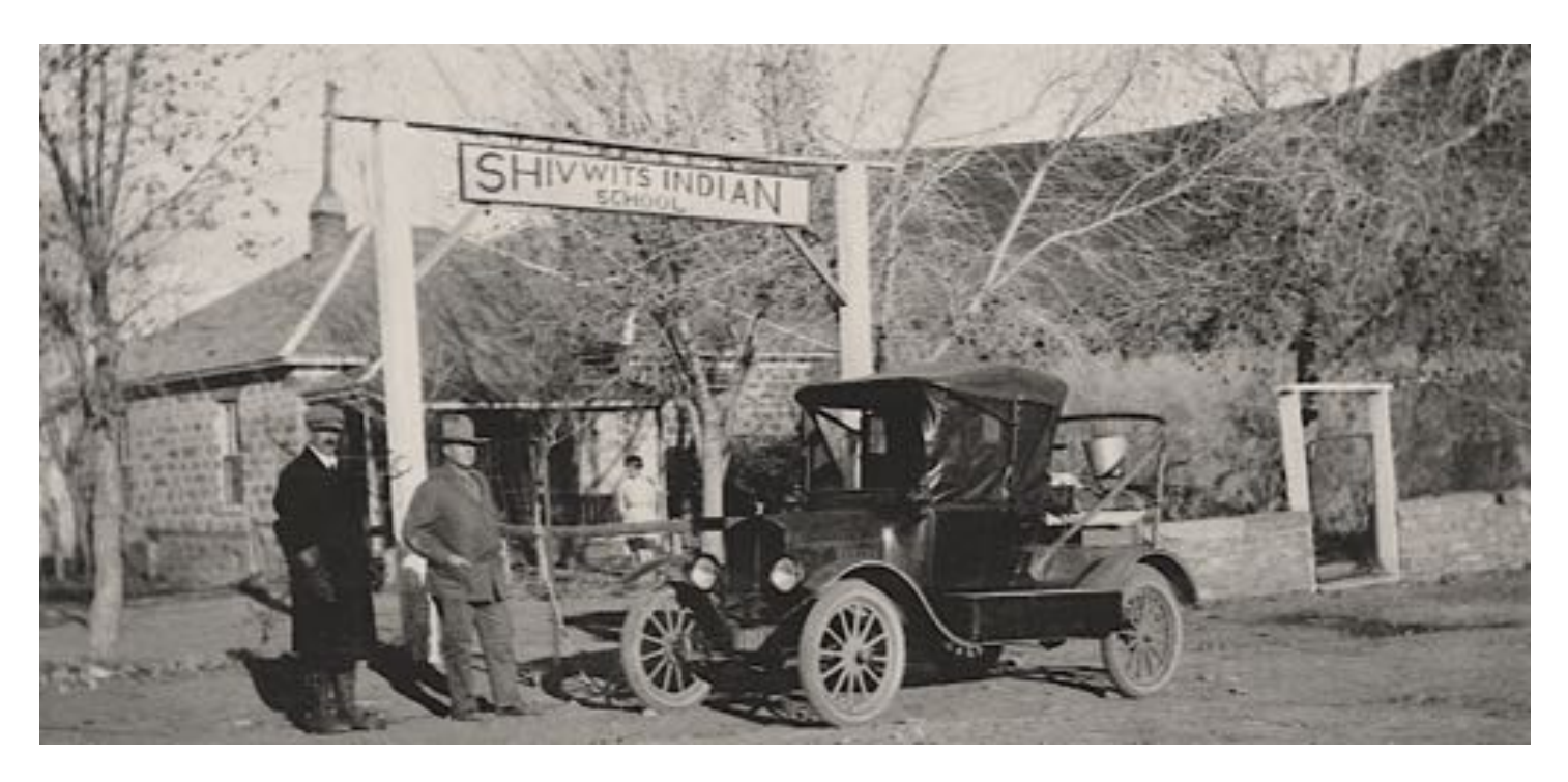
Shivwits Indian School, 1933

An Indian appropriation bill was passed by congress in late 1898, appropriating $25,000 for the purchase of land and the erection of buildings on Santa Clara creek. An additional $2,500 was set aside for the educational necessities of Shebits students.