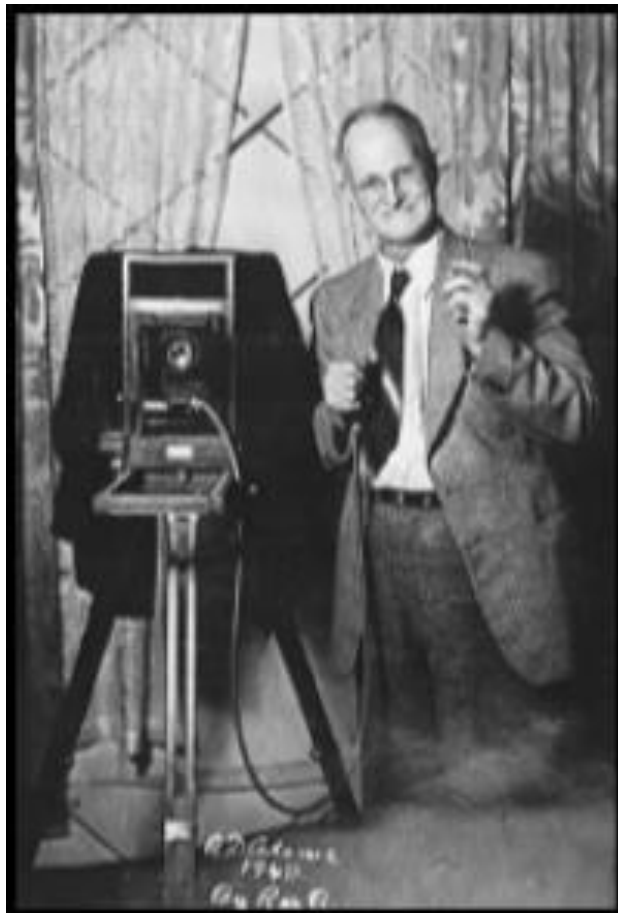
R D's "selfie" taken in front of a mirror in 1948 16