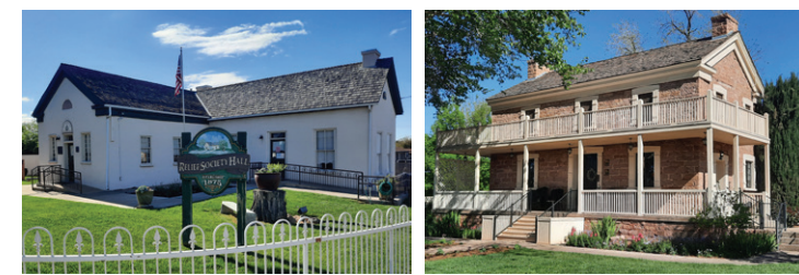
Relief Society Hall | 75 W Telegraph St. Covington Home | 181 E. 200 N.

Other historic landmarks include the Cotton Factory, now Star Nursery; the Relief Society Hall, the oldest Relief Society Hall still in use in Utah; and the Covington Home built in 1858, the oldest surviving residence in Washington County. For more information, inquire at the museum.