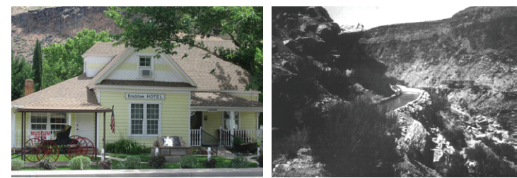
Bradshaw House | 85 W State St. Hurricane Canal

For more information: wchsutah.org/museums/hurricane-pioneer-museum.php