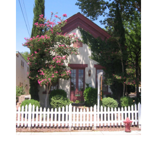
Gardener's Club (1863)