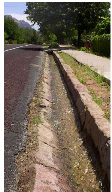
Roadside Ditches, WPA (1940)