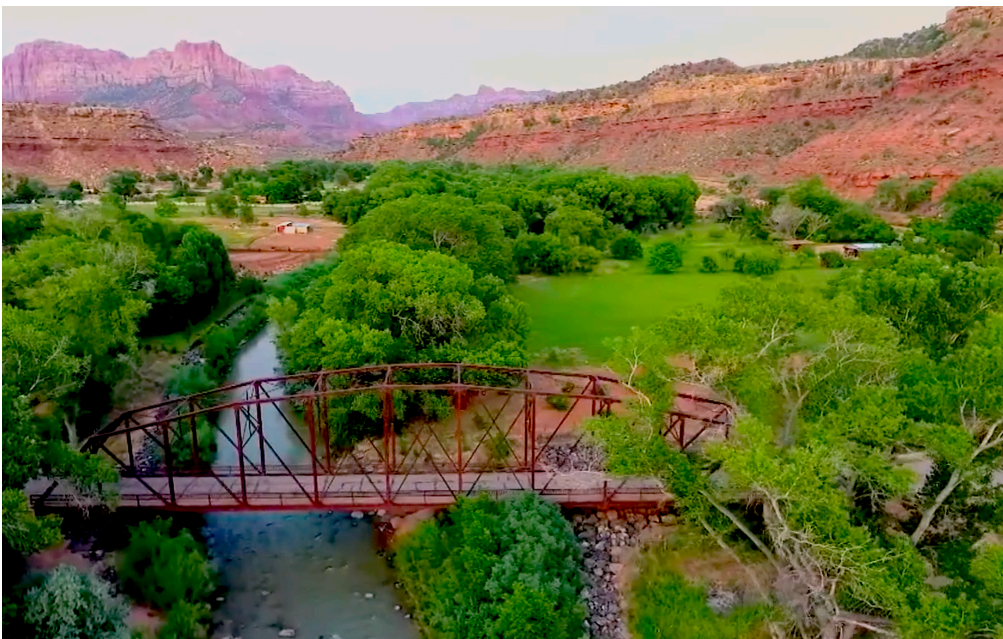
Rockville Bridge (1924)

Rockville Deseret Telegraph and Post Office (1870)