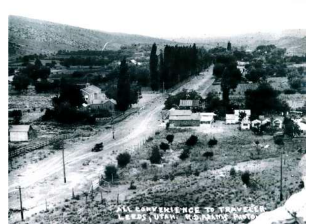
Leeds Main Street (1930s)