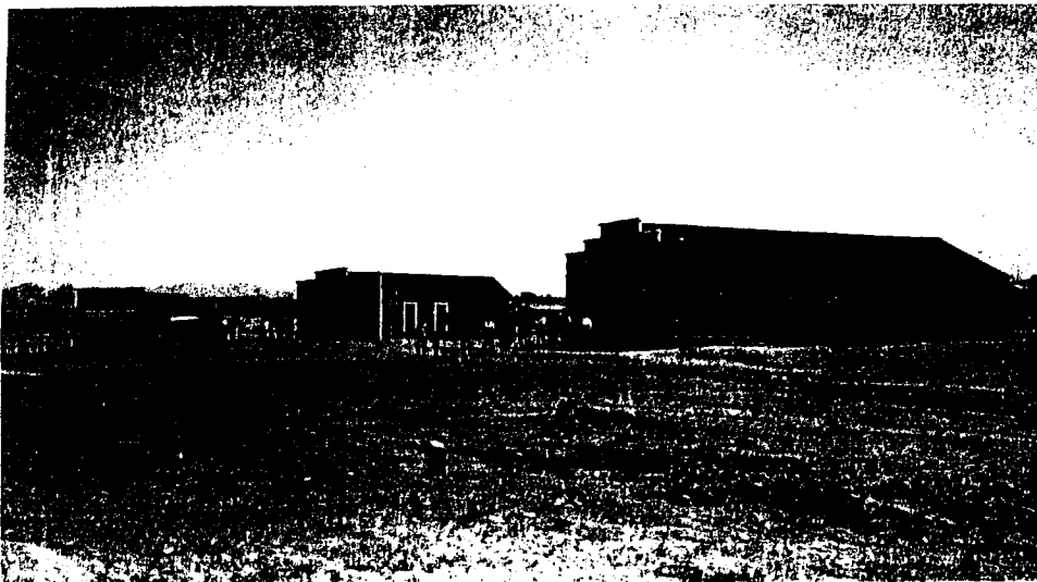
Moapa, Nevada, April 1907. Buildings include hotel and store.

PPTC line traversed the mountains and desert west of Gunlock and crossed into Nevada near the plateau/desert created by the Beaver Dam Wash drainage area. After leaving Mesquite and Bunkerville the line closely followed the banks of the Virgin River, going southwest toward Moapa, Nevada, where the company ended its line. The men responsible for maintaining this line lived with the certainty of having some part of the line grounded and shorted out nearly every day. They were seldom disappointed.