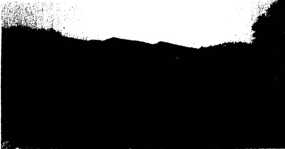
Area south of Gunlock, Utah, ca. 1940, was typical of the terrain where the PPTC built its lines. Above: PPTC minute book.