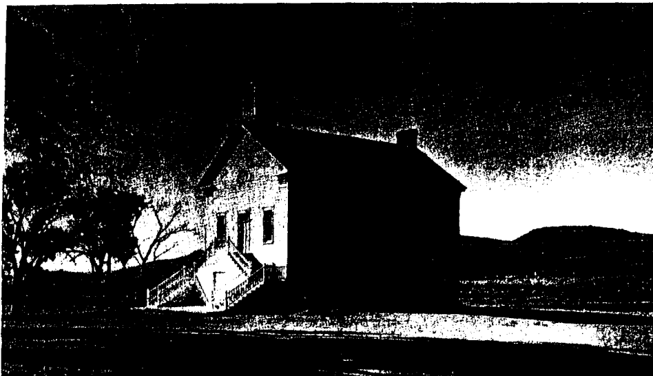
Pine Valley LDS Chapel. This once remote area of Washington County was served by the PPTC. USHS collections.

each call, but we must take our own phones.” The board discussed the matter at “considerable” length and asked the secretary to take the rate matter up with SUTC. The meeting lasted until 2 a.m. 16