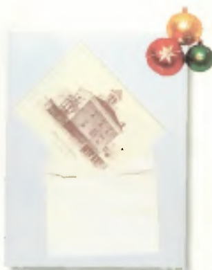
Note cards, a valuable item for any home, adults or children alike. We have a generous supply of 8 for $10.00.

With the year coming to a close, the month of December is traditionally a time for many of us to make out our charitable gifts. We hope you will remember the Historical Society with a year-end donation. For those of you undertaking estate planning during the course of the up-coming year, we'd also like you to remember the Society should you be considering philanthropic gifts through your Will.