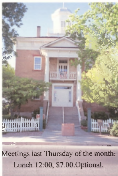
Meetings last Thursday of the month: Lunch 12:00, $7.00.Optional.