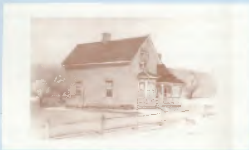
From Historical Buildings of Washington County, Vol. 2 - $5.00