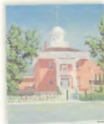
Post Cards - 5 for $1.00

Art and history of Upper Dixie Legacy Gold of the Standard Edition, a truly lovely gift for family and friends. From $49.95 to $19.95.